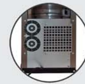
High Capacity Direct Chill System