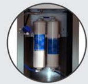
Built-In, Easy Access Filtration System