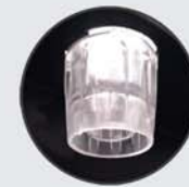
No-Touch Shrouded Water Dispensing

P: 877.209.7634 F: 908.248.1801 395 Main Street West Creek, NJ 08092 sales@aquaverve.com